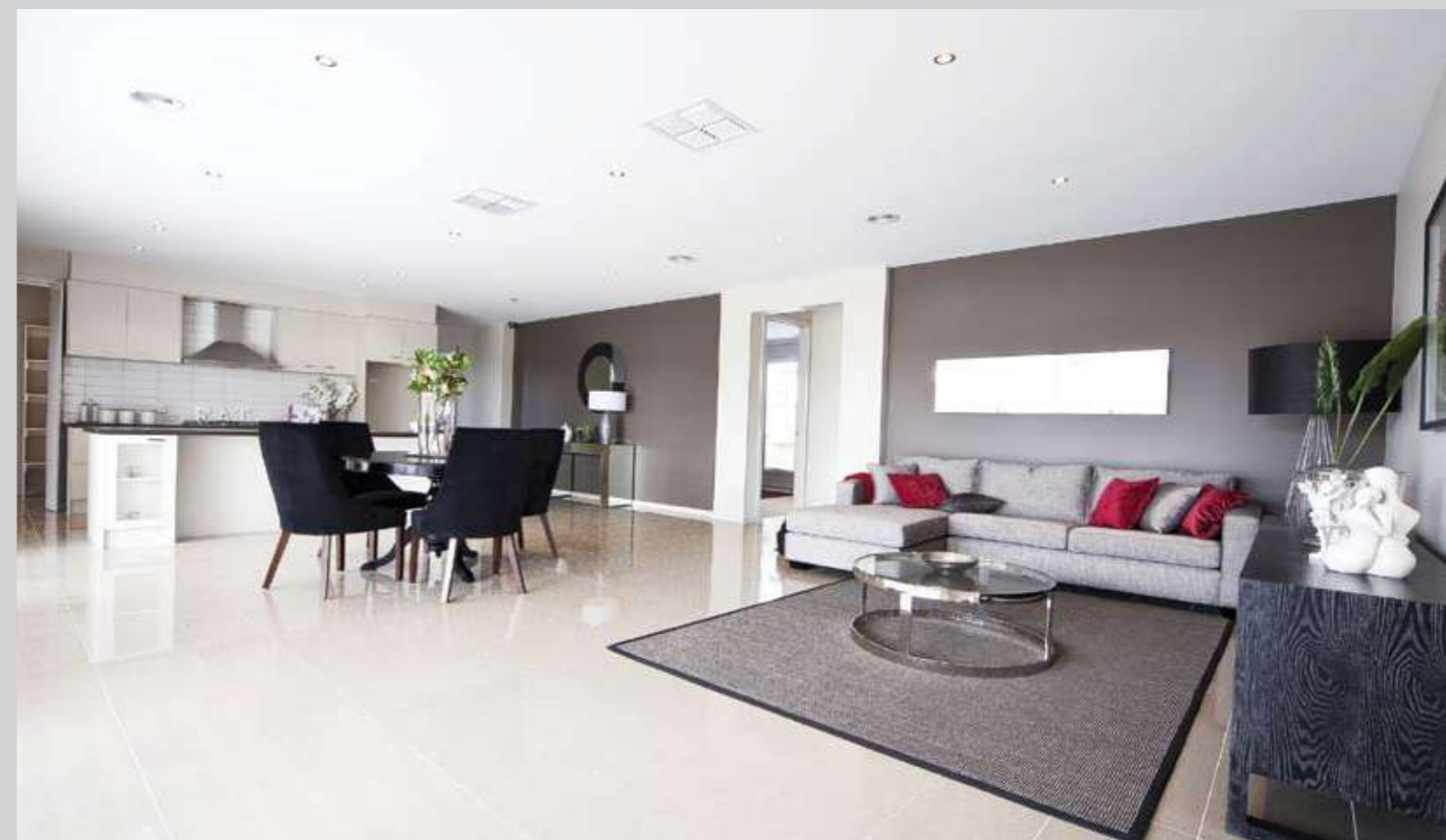
Artist impressions are for illustration purposes only. Finished product may differ from impression above.